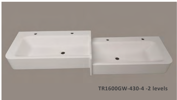
TR1600GW-430-4 -2 levels

The product is environmentally assessed with the best rating.